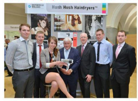
ling Electrics Product Hush Hush Hairdryers Cork Institute of Technology Company Sweet Sounding Electrics

Cruickshank Intellectual Property Attorneys Most Technologically Innovative Product 2013 - €5,000