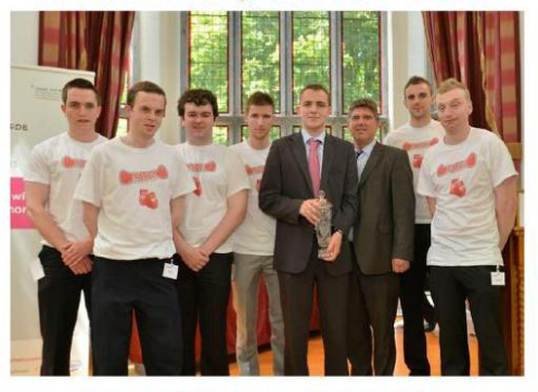
Company 123 Fitness Product Robobox Cork Institute of Technology Sports Training Device Development

2013 Think Outside the Box Finals Galway National Award of Merit 2013 - €1,500